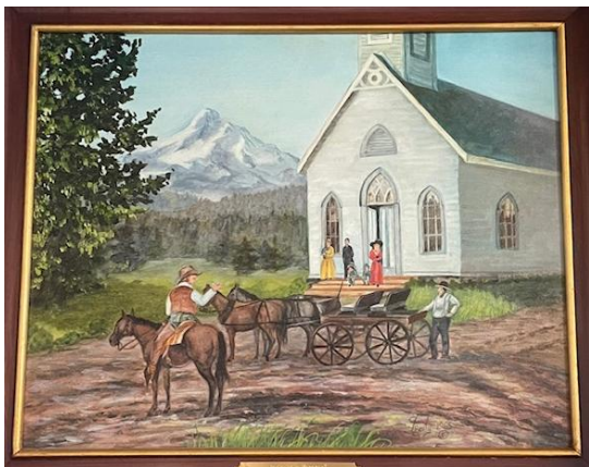
The Valley Church, Barrett Drive

And so began the journey toward the creation of Hood River Valley Christian Church! More to come in the next newsletter!