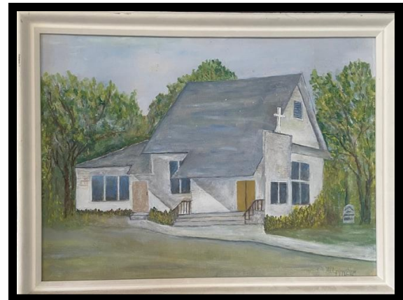
First Christian Church, 9 th & Eugene

A few members of our church family might recall August 16, 1964 when the first worship service at Hood River Valley Christian Church's 975 Indian Creek Road location was held. What a grand day it must have been, and what a joy it will soon be to commemorate 60 years of ministry!