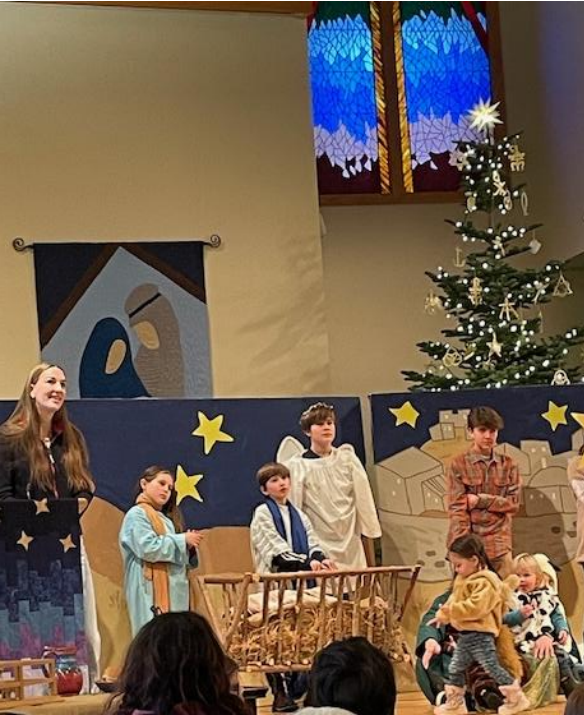
Children & Youth Christmas Play