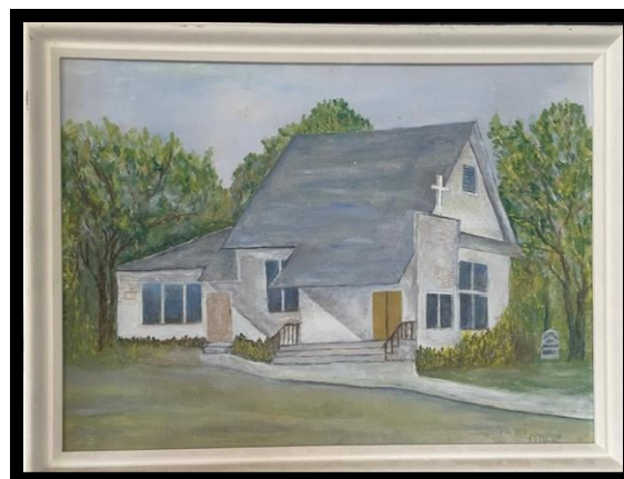
First Christian Church, 9 th & Eugene

A few members of our church family might recall August 16, 1964 when the first worship service at Hood River Valley Christian Church's 975 Indian Creek Road location was held. What a grand day it must have been, and what a joy it will soon be to commemorate 60 years of ministry!